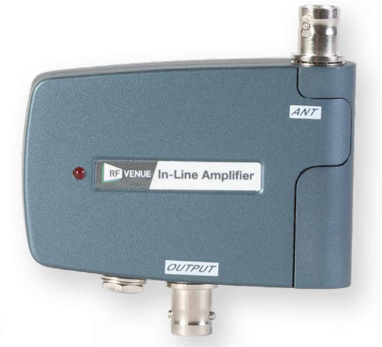
SKU ILAMP-ACT Includes: (1) Inline Amplifier (1) AC Power Supply (1) Mounting Bracket & Screws (1) Spec Sheet / User Guide